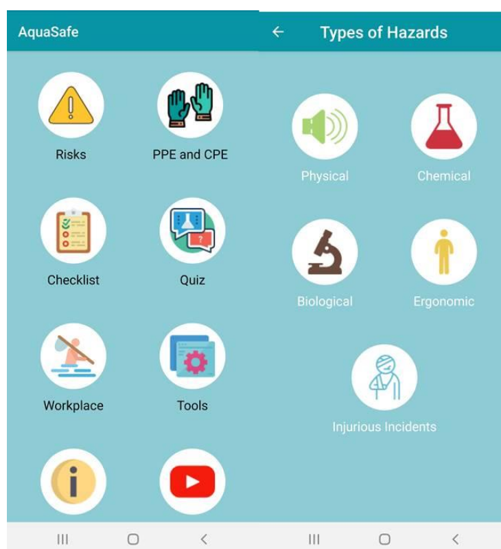
Figure 1. Image of the application with different icons including risks, PPE and CPE, Checklists, Quiz.

Interaction with the user takes place through three major interactive environments using the checklist, the quiz and the question-answer control tool. The checklist is divided for use by three main groups viz: general, management and workers. The general checklist has a set of guidelines provided according to the options selected by the user based on current working conditions prevalent at the workplace. Management checklists relate to the specific activity performed such as diving, chemicals and other risks, and advises the user on relevant corrective actions when these actions are not identified in the workplace. The checklist for workers has a focus on workers' rights and actions and also directs the user to relevant corrective measures. The quiz is designed as a series of questions in 'serious game' format, to support and facilitate learning.